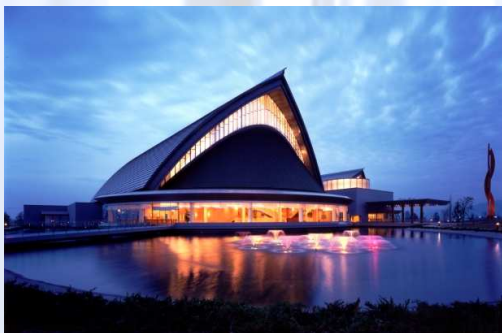
Fukui Harmony Hall